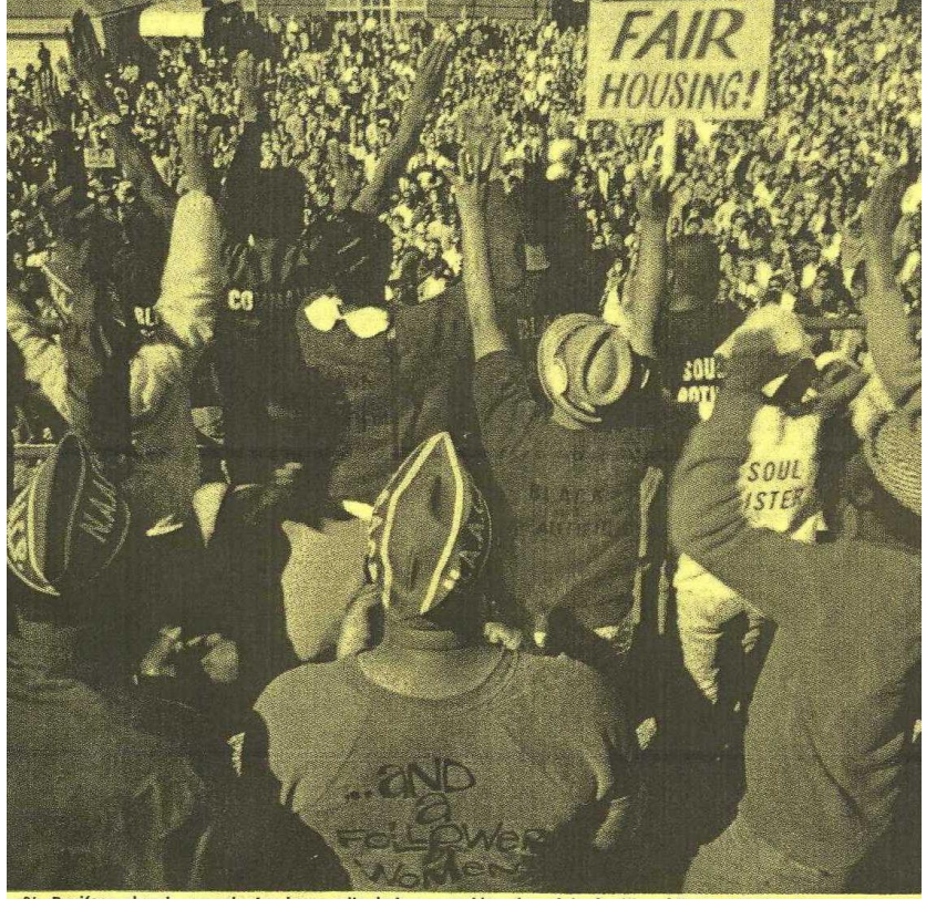
1 St. Boniface church grounds for huge rally before marching deep into hostile white community to protest city's