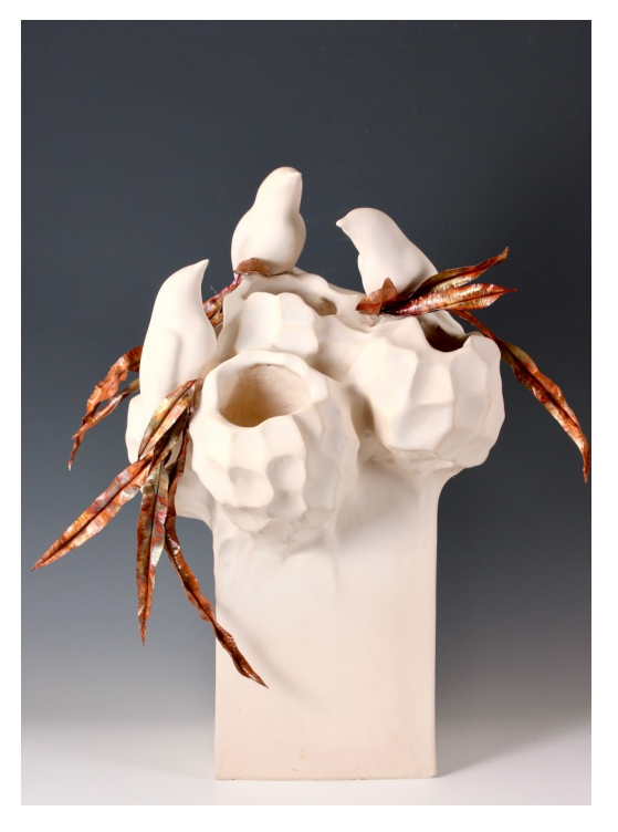
Gene Swanstrom (Mesa, AZ) Tranquility , 2022 Stoneware and copper, 17 x 14 x 11 inches