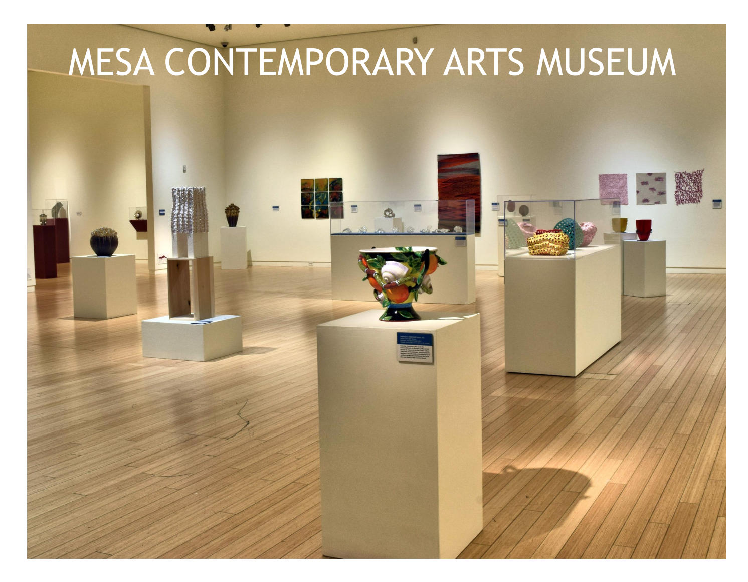
44th Annual Contemporary Craft Exhibition February 10-April 23, 2023

Contemporary Craft | Tradition and Innovation Grades: K-4