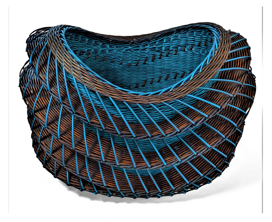
Peta Tinay (Orinda, CA) Vessel 3, 2 021, Round reed and cane, 16 x 28 x 18 inches