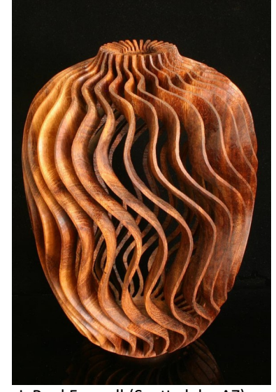
J. Paul Fennell (Scottsdale, AZ) Acacia Waves, 2021, Wood turned Acacia, 10 x 7 x 7 inches

Contemporary craft grew out of the tradition of artisans making functional objects like quilts, wooden tools and books. The British Arts and Crafts movement of the 19<sup>th</sup> century elevated the decorative craft of tradesmen to art that expresses themes and concepts in an artistic manner.