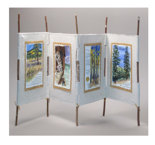
Margy O'Brien (Albuquerque, NM), Valle Grande, 2019, Fiber Artist Book, 14 x 7 x 4 inches