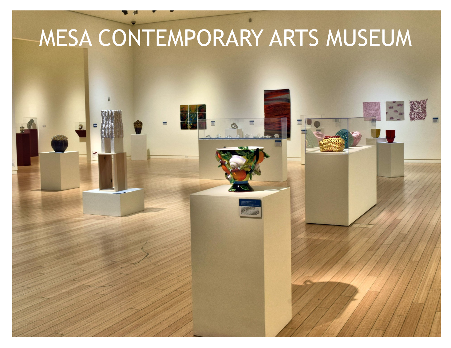
42nd Annual Contemporary Craft Exhibition February 12-April 18, 2021

Contemporary Craft | Tradition and Innovation Grades: K-4