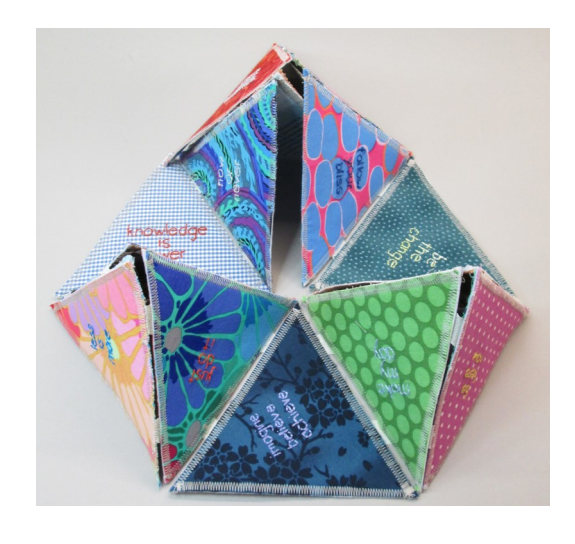
Margy O'Brien (Albuquerque, NM), Just 3 Words , 2019, Fiber, Artist book, 6 x 31 inches extended