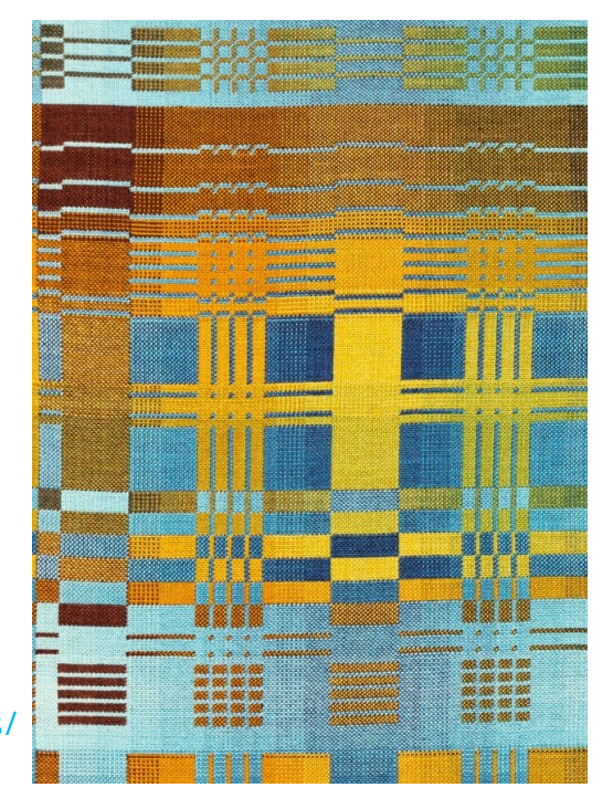
Nancy Middlebrook (Philadelphia, PA), Norway #5 , (detail) Woven hand-dyed cotton, 23 x 9 x 1 inches.

https://www.dickblick.com/products/wide-notch-cardboard-looms/