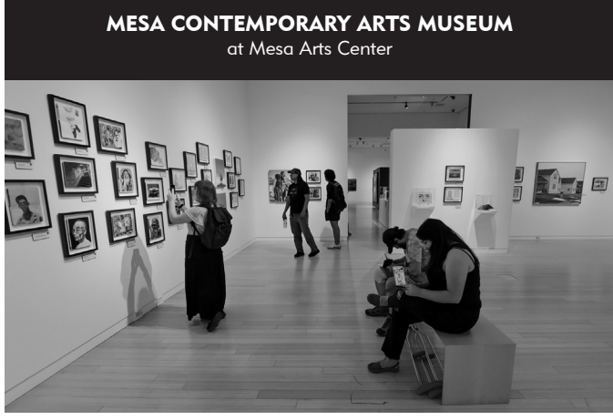
Participates getting their draw on in The Moleskine Project exhibition during MCA Museum's Drink + Draw event, Oct 14, 2022.

Mesa Contemporary Arts Museum is currently not accepting any unsolicited proposals. Artists who DO NOT follow the guidelines outlined in the Prospectus or were not contacted directly by Mesa Contemporary Arts Museum staff about participating in an exhibition are considered unsolicited artists. Artists who apply for an opportunity and follow the guidelines outlined in the Prospectus ARE considered solicited. Materials from random proposals will be returned without comment.